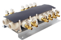
6907912CP 12 Port Manifold