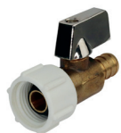
APXFF1212S Replacement Valve