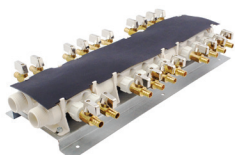
6907920CP 20 Port Manifold