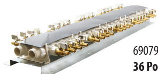
6907936CP 36 Port Manifold