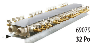
6907932CP 32 Port Manifold