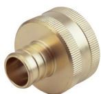
APXNPSM34 Replacement Inlet Adapter