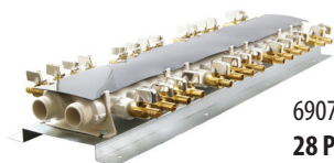
6907928CP 28 Port Manifold