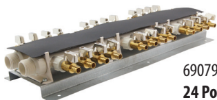
6907924CP 24 Port Manifold