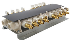
6907984CP 16 Port Manifold